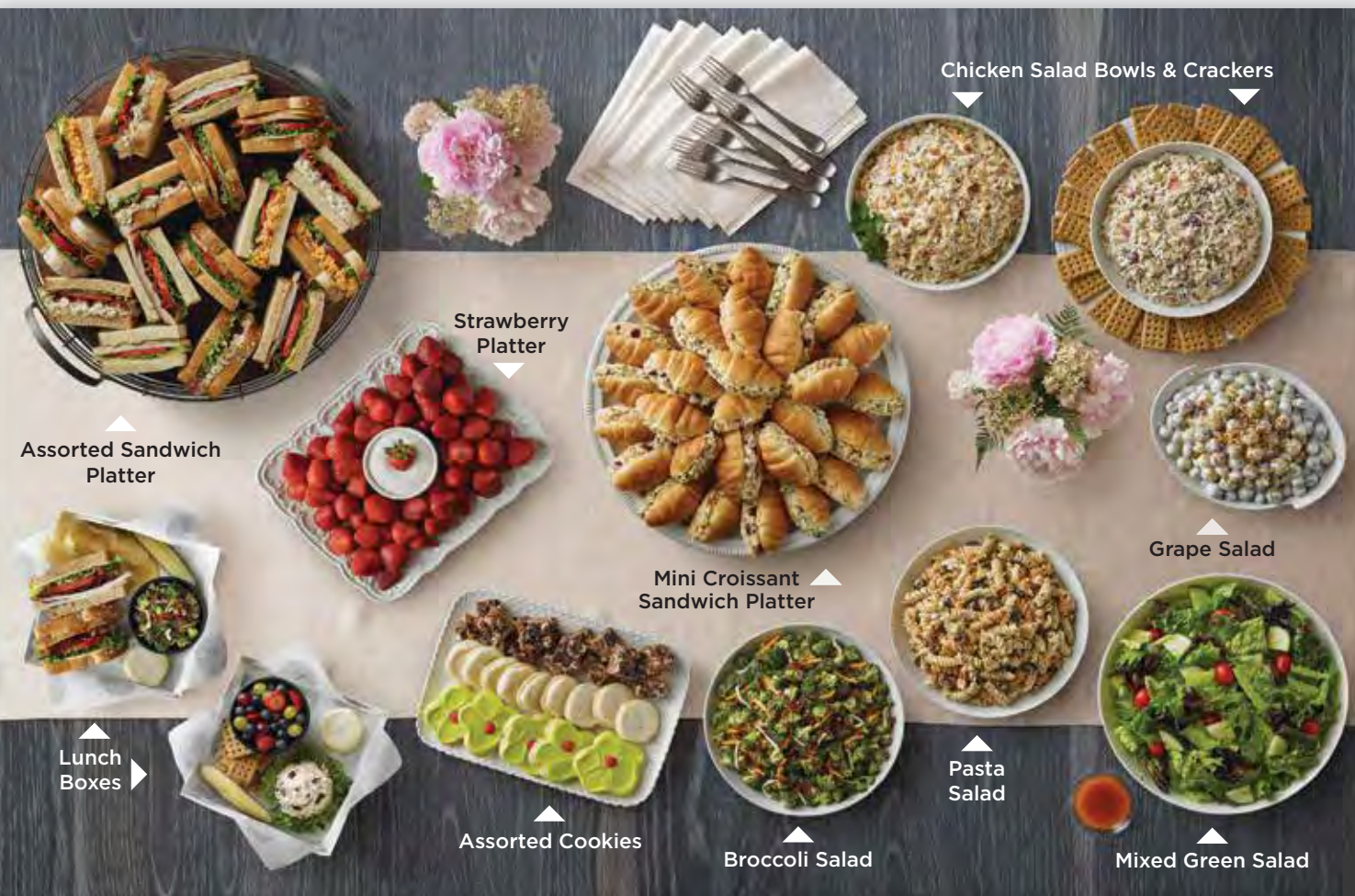
Assorted Sandwich Platter

$11.50 Single Box with two sides or chips (640-1515 cal)