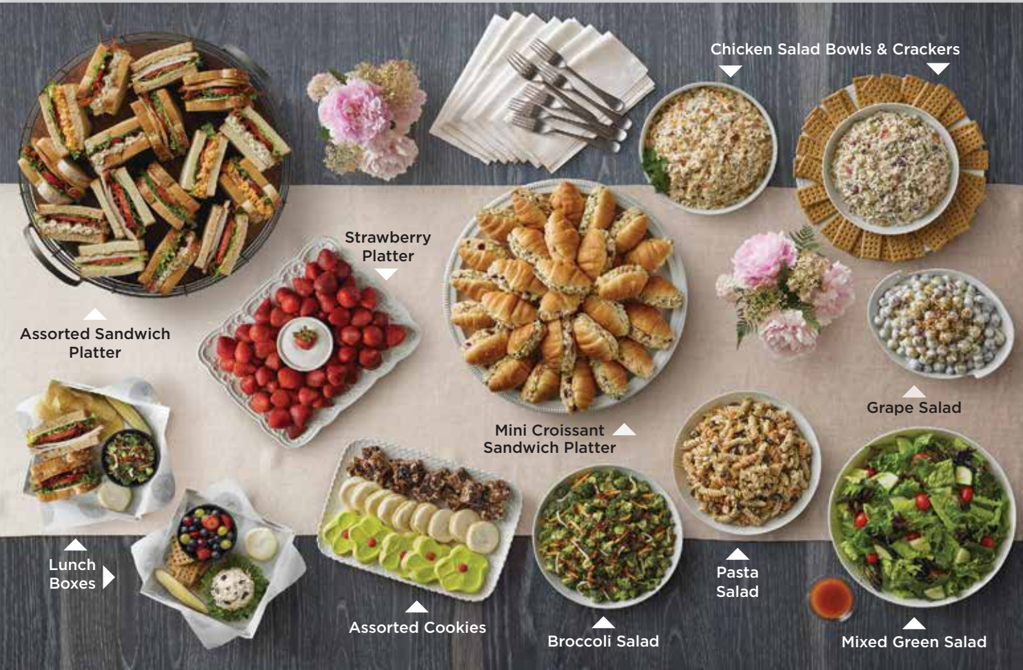
Assorted Sandwich Platter Lunch Boxes Strawberry Platter Mini Croissant Sandwich Platter Assorted Cookies Broccoli Salad Pasta Salad Mixed Green Salad Grape Salad Chicken Salad Bowls & Crackers

$11.50 Single Box with two sides or chips (640-1515 cal)