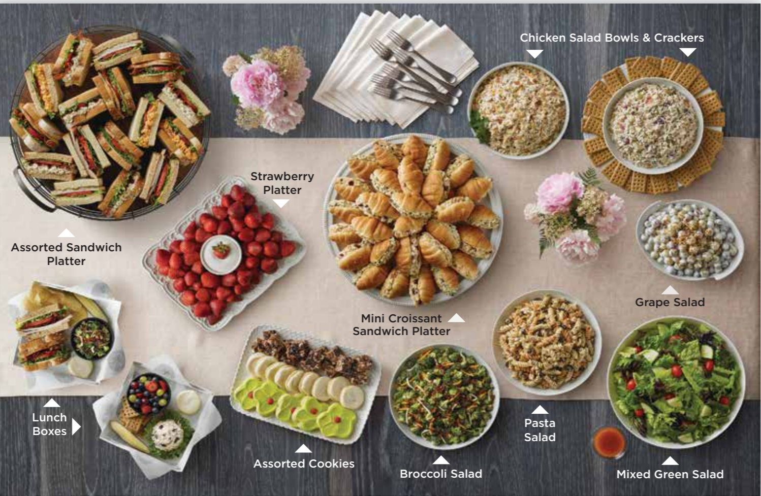
Assorted Sandwich Platter